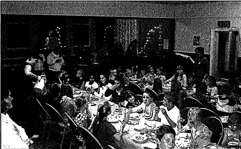
A chaotic but scrumptious party tea

Next it was craft time: every child made a stand-up star to take home with them to remind them to "shine like stars in the universe" (Philippians 2:15). After all that we had 5 minutes left to have a quick chat about Jesus being the "Light of the World", and him