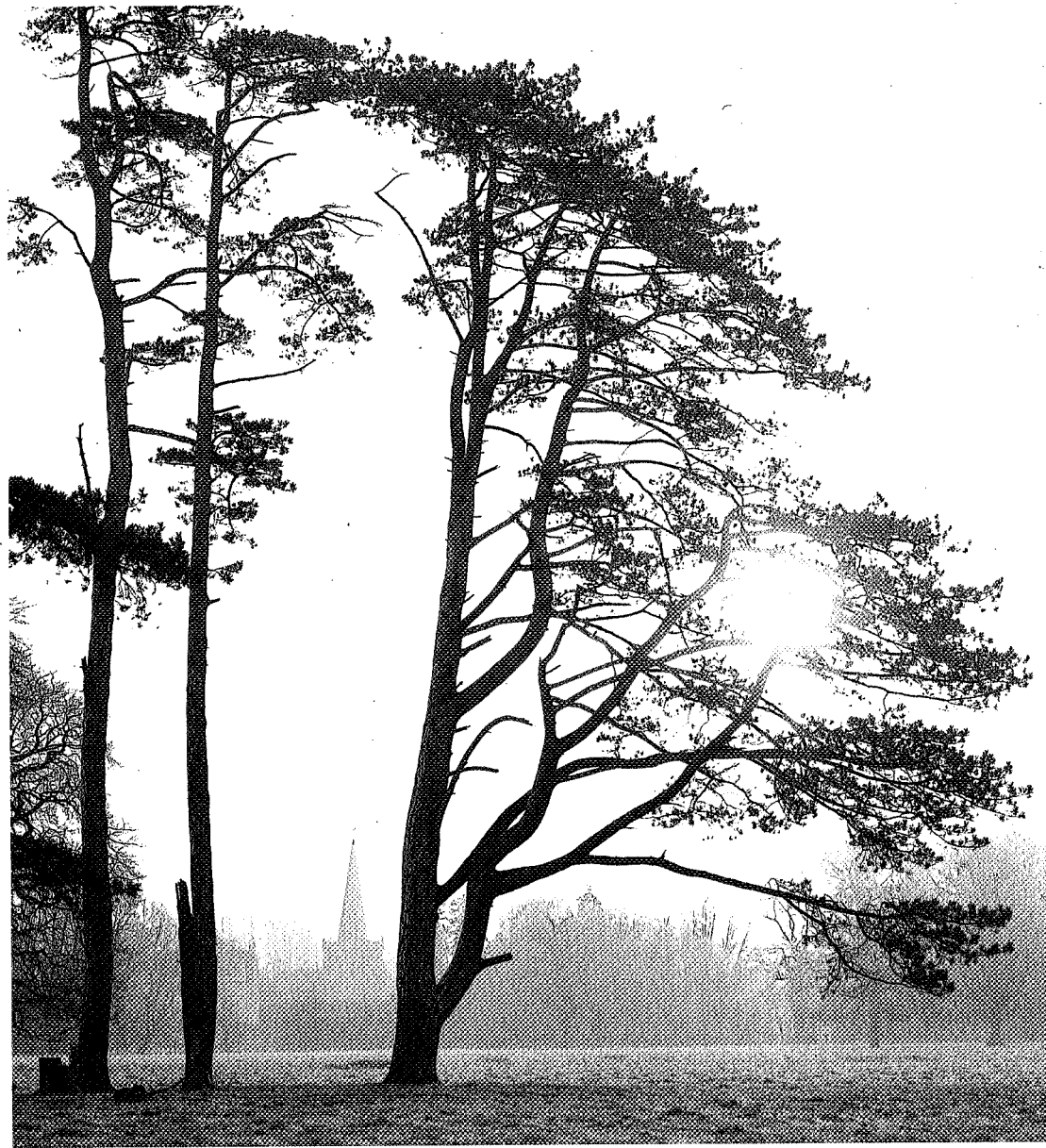
A winter sunrise over the south Gloucestershire village of Down Amney, birthplace of composer Ralph Vaughan Williams

CC series cover published by G. J. Palmer & Sons Ltd, 10 Albygate, Bexley, Suffolk NR34 9TB Printed in Great Britain by Fulcrum Colour Printers Ltd, Bournemouth