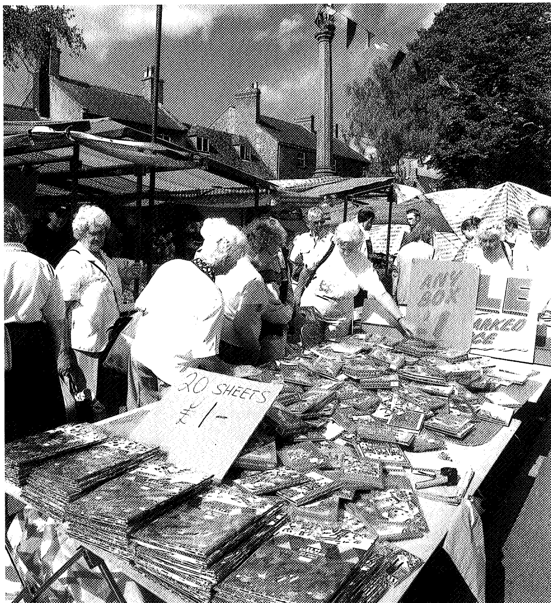
Early preparations for Christmas at the weekly market held in the wide main street of Moreton-in-Marsh in the Cotswolds

KC series cover published by G.L. Palmer & Sons Ltd, 16 Plybourn Rd, Ipswich, Suffolk IP13 4 3TB Printed in Great Britain by Fulcrum Colour Printers Ltd, Belper, Derby