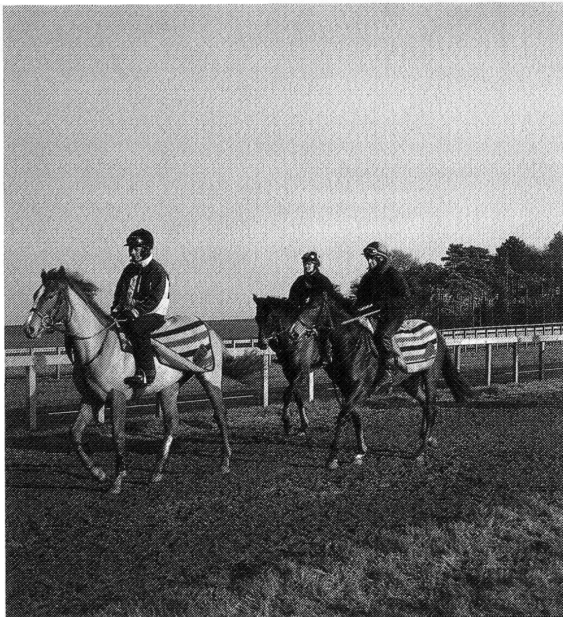
Early morning session at Newmarket Heath for these thoroughbred horses awaiting the start of the flat racing season

EA news cover published by G.J. Palmer & Sons Ltd, 18 Oldburgate, Bicester, Suffolk NR24 9TB Printed in Great Britain by Fulcrum Colour Printers Ltd, Aldeburgh