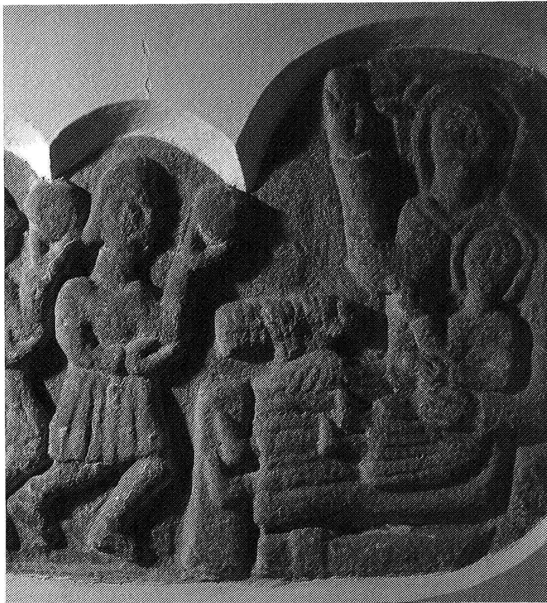
The Adoration of the Magi at Kirknewton, Northumberland JJ series cover published by G. J. Palmer & Sons Ltd, 16 Blyburgate, Beccles, Suffolk NR34 9TB Printed in Great Britain by Stott Brothers Ltd, Halifax

8.00am Communion 10.30am Family Communion 6.30pm NO EVENING SERVICE