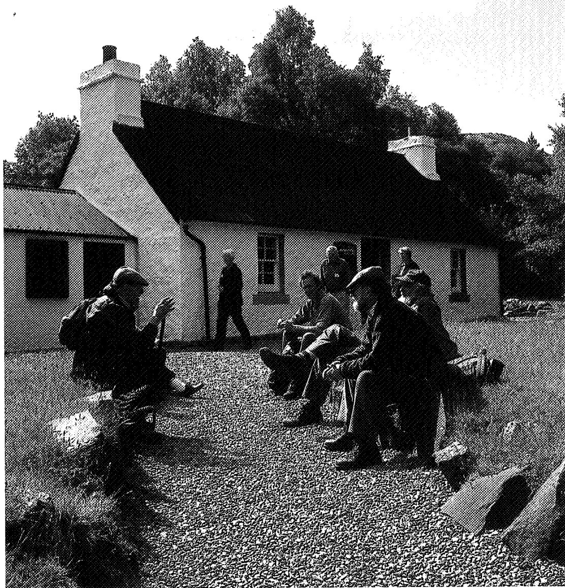
Feasting time at Balnaglo Nature Reserve, Wester Ross, Scotland. LJ series cover published by G.J. Palmer & Sons Ltd, 18 Ryburgh, Beccles, Suffolk NR34 0TB Printed in Great Britain by Stott Brothers Ltd, Halifax