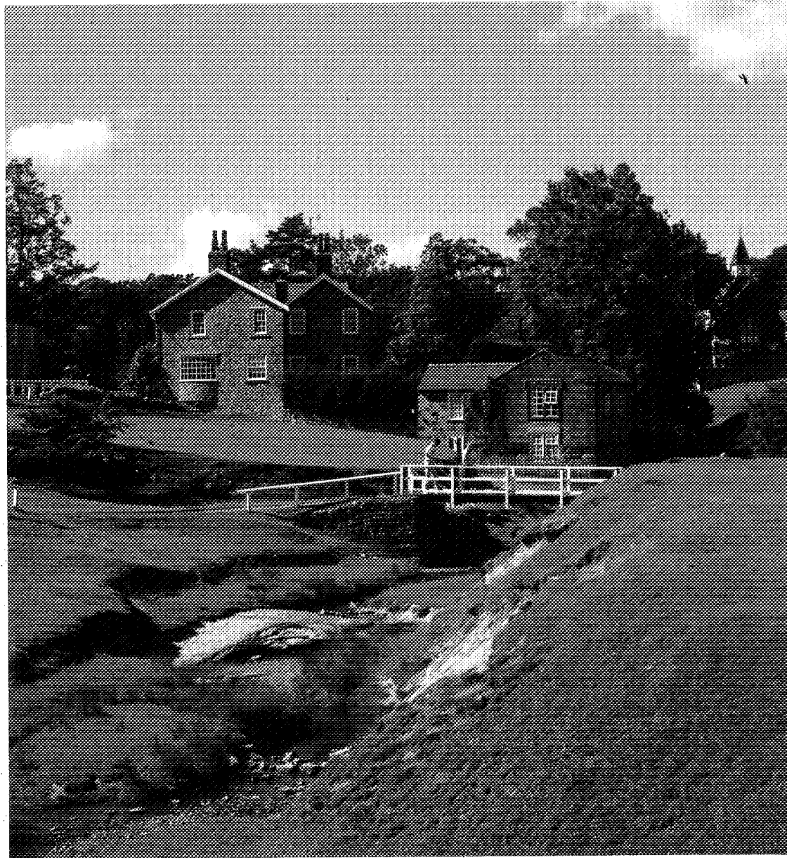
Hutton Beck at Hutton-le-Hole in the North York Moors National Park JJ series cover published by G.J. Palmer & Sons Ltd, 16 Blyburgate, Beccles, Suffolk NR34 9TB Printed in Great Britain by Stott Brothers Ltd, Halifax