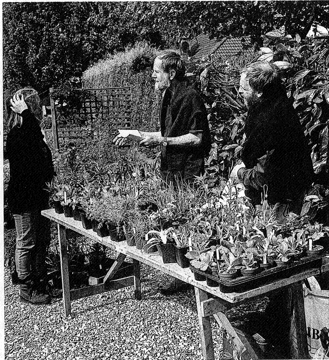
Well stocked plant stall at Sixwold, near Horncastle, Lincolnshire JJ series cover published by G.J. Palmer & Sons Ltd, 16 Blyburgate, Beccles, Suffolk NR34 9TB Printed in Great Britain by Stott Brothers Ltd, Halifax