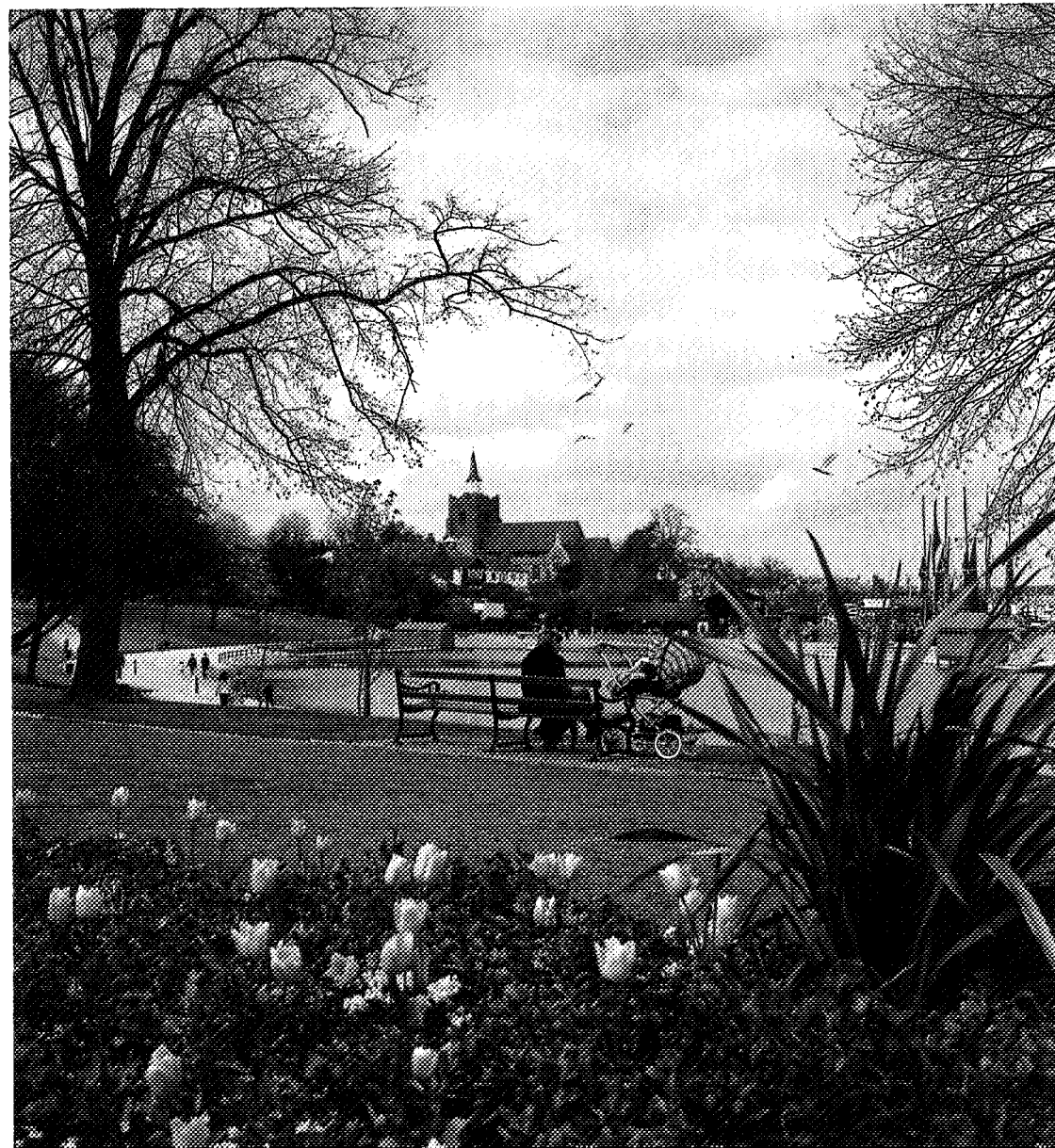
Riverside promenade and gardens at Maldon, Essex JJ series cover published by G.J. Palmer & Sons Ltd, 16 Blyburgate, Beccles, Suffolk NR34 9TB Printed in Great Britain by Scott Brothers Ltd, Halifax