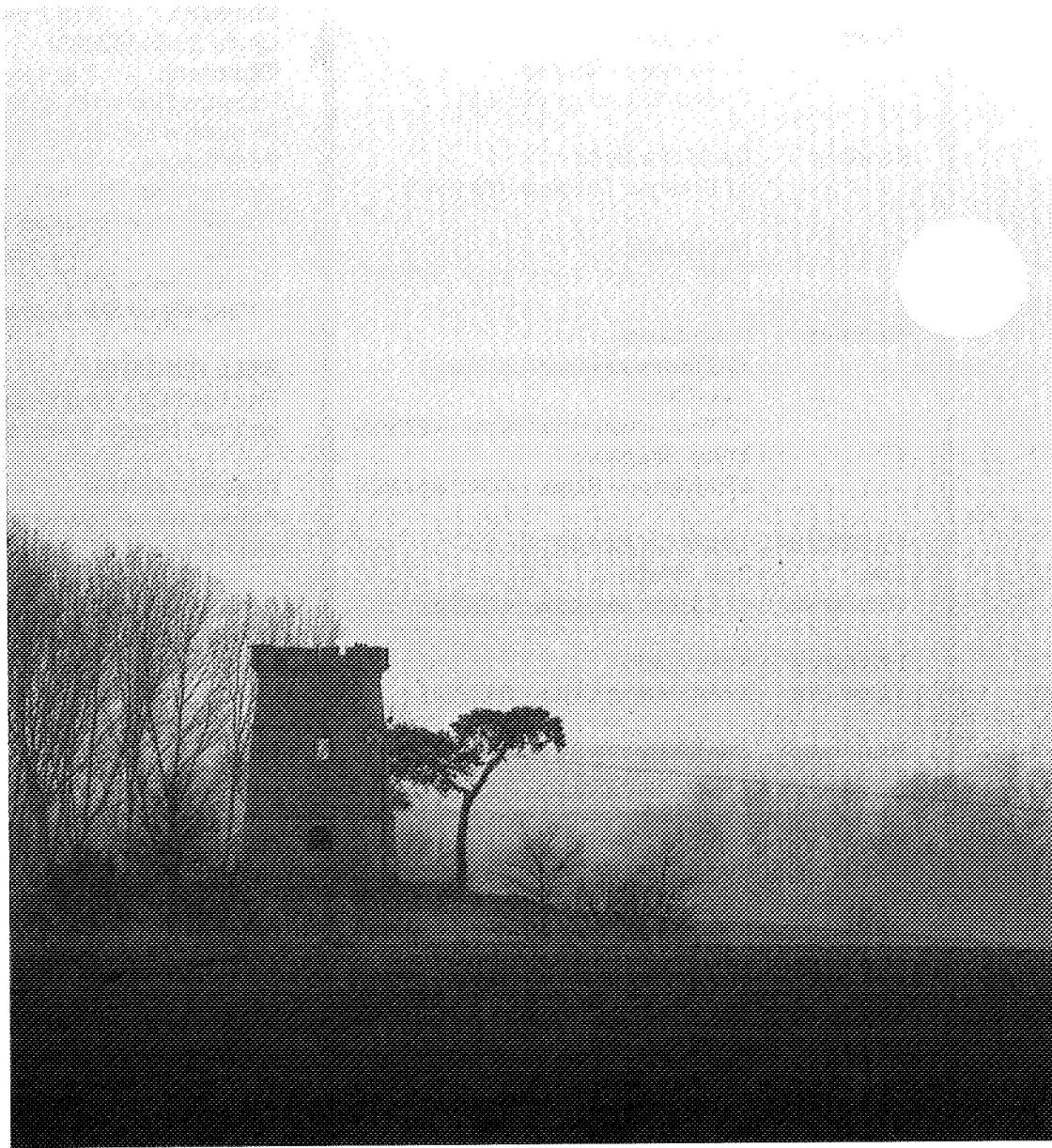
Sunset over a castle tower folly near Cranbury, Dorsetshire J.J. series cover published by C. J. Palmer & Sons Ltd, 16 Ditchingham, Bexhill, Suffolk NR29 0TB Printed in Great Britain by Starr Brothers Ltd, Hatter