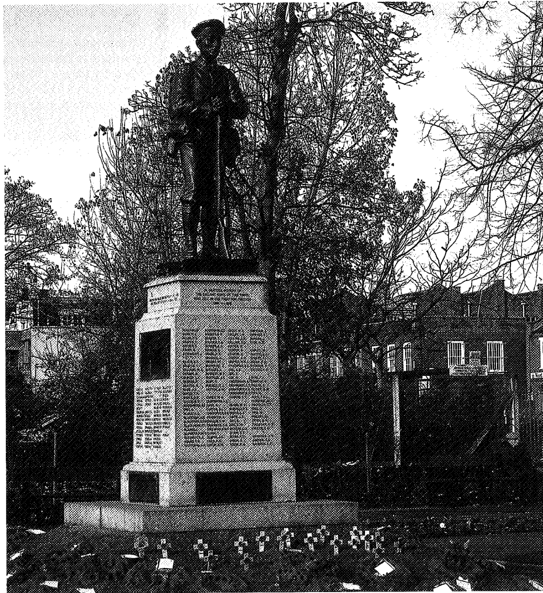
'Last we forget' The imposing War Memorial at Dartford, Kent NH series cover published by G.J. Palmer & Sons Ltd, 13 Elmbridge, Bawdes, Suffolk NR34 5TB Printed in Great Britain by Scott Brothers Ltd, Ipswich