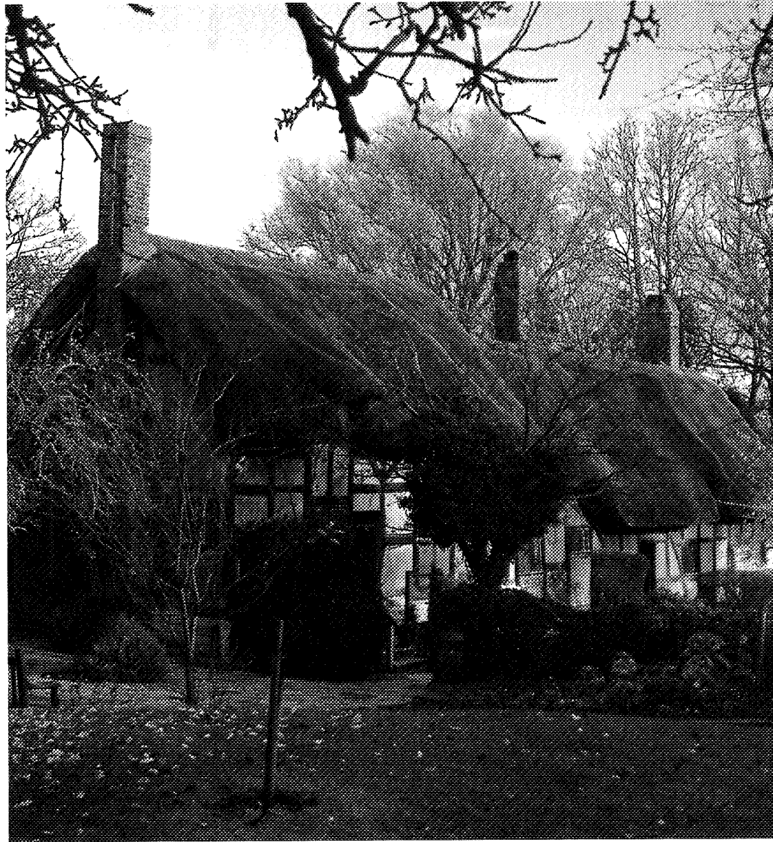
Anne Hathaway's cottage at Shottery, Stratford upon Avon HH series cover published by G.J. Palmer & Sons Ltd, 16 Blyburgate, Beccles, Suffolk NR34 9TB Printed in Great Britain by Stott Brothers Ltd, Halifax