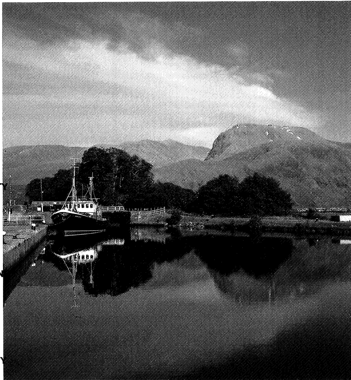
Ben Nevis and the Caledonian Canal at Corpach near Fort William HH series cover published by G.J. Palmer & Sons Ltd, 16 Blyburgate, Beccles, Suffolk NR34 9TB Printed in Great Britain by Stott Brothers Ltd, Halifax