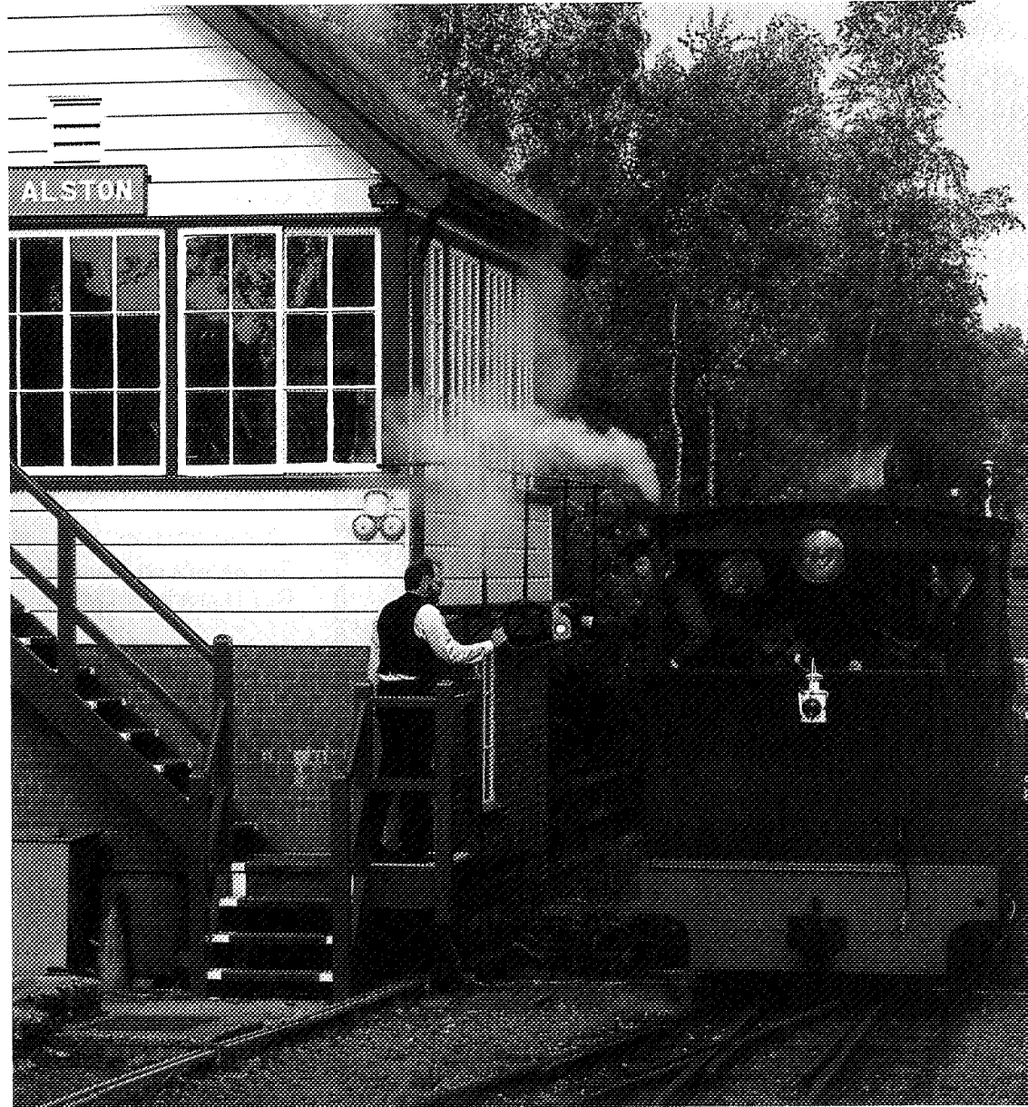
South Tynedale Railway on the Cumbria/Northumberland border HH series cover published by G.J.Palmer & Sons Ltd, 16 Blyburgate, Beccles, Suffolk NR34 9TB Printed in Great Britain by Stott Brothers Ltd, Halifax