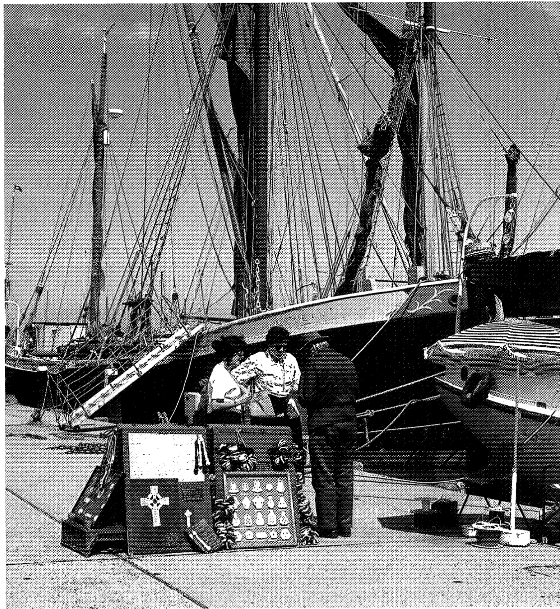
An unusual display of knits on the quayside at Alington, Essex 1991 series cover published by G. J. Palmer & Sons Ltd, 15 Eldongate, Bedford, Bedfordshire MK43 9TF Printed in Great Britain by Durr Brothers Ltd, Milton