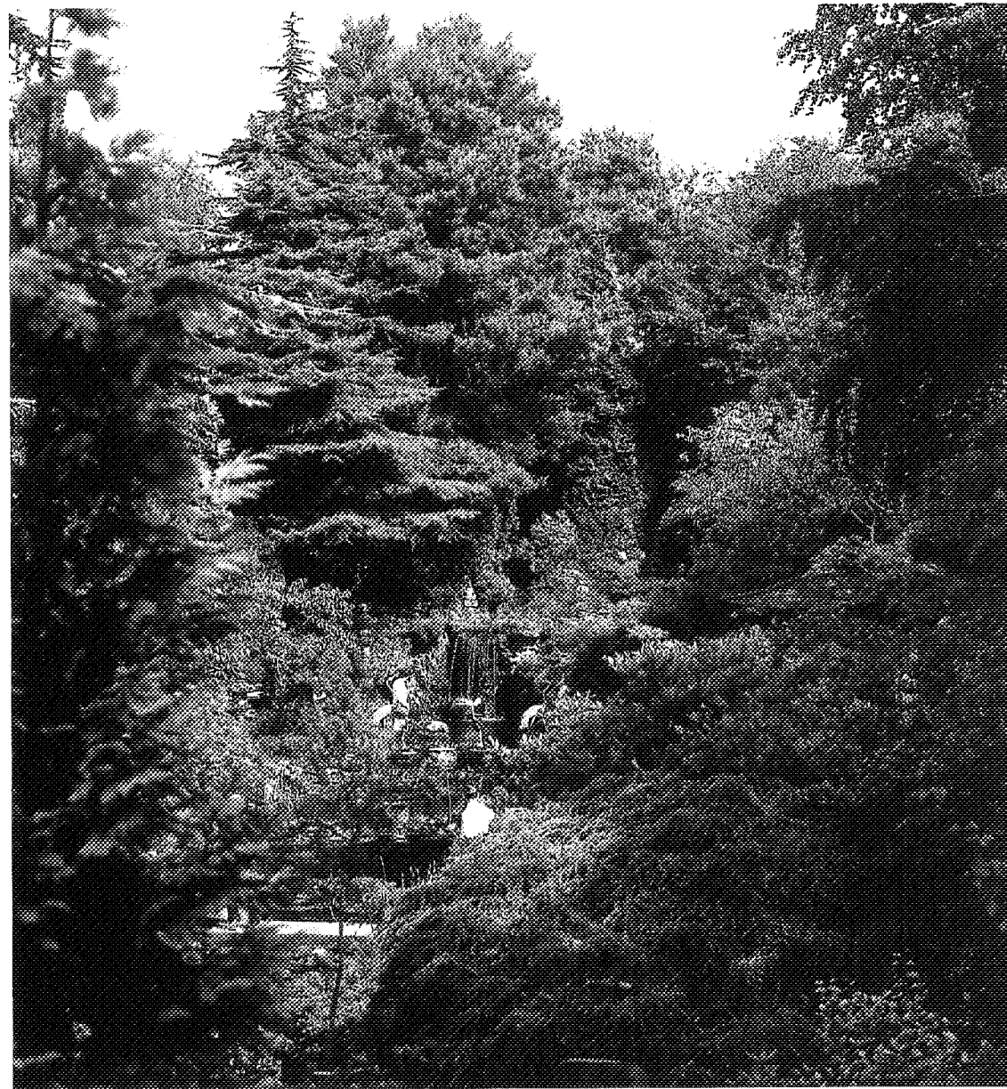
Banks of trees and shrubs at Compton Acres Gardens, Poole, Dorset HH series cover published by G. J. Palmer & Sons Ltd, 16 Blyburgate, Beccles, Suffolk NR34 9TB Printed in Great Britain by Stott Brothers Ltd, Halifax

8.00am Communion 10.30am Family Communion 6.30pm Deanery Festival Service