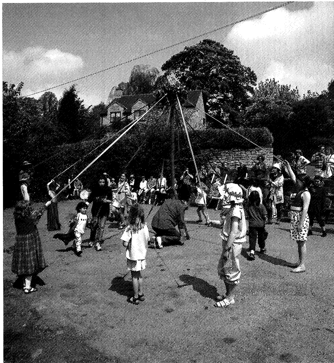
A traditional May Day festival at Milford in Derbyshire HH series cover published by G.J. Palmer & Sons Ltd, 16 Blyburgate, Beccles, Suffolk NR34 9TB Printed in Great Britain by Stott Brothers Ltd, Halifax

8.00am Communion 10.30am Family Service 6.30pm Confirmation The Bishop of Bolton