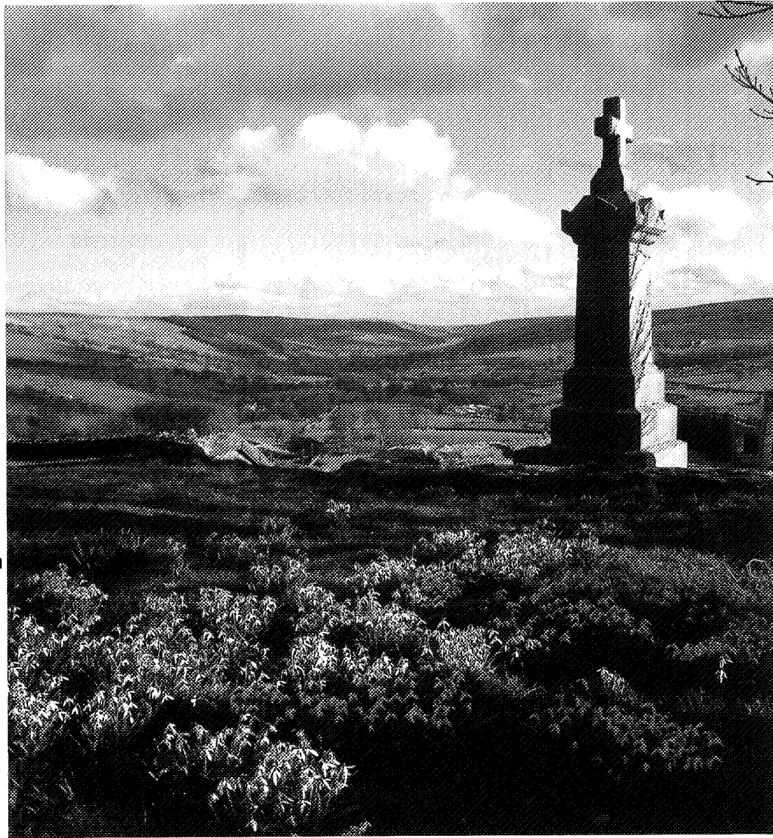
Middlesmoor, high above Nidderdale in North Yorkshire HH series cover published by G.J. Palmer & Sons Ltd, 18 Blyburgate, Beccles, Suffolk NR34 9TB Printed in Great Britain by Stott Brothers Ltd, Halifax

8.00am Communion 10.30am Family/Parade Service 6.30pm Evening Communion