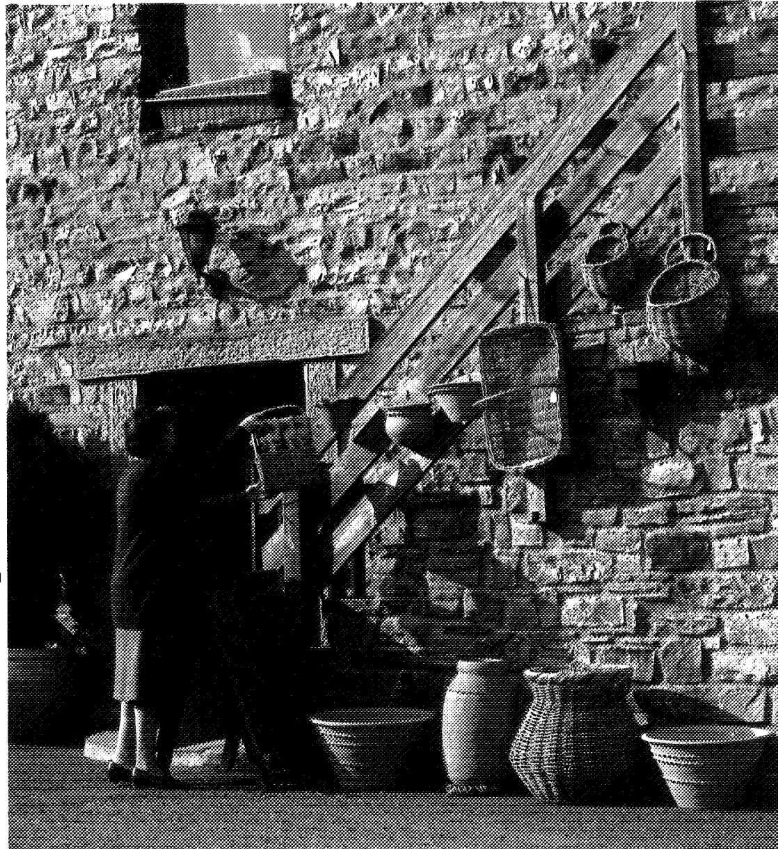
Pots and baskets on display at Aysgarth, North Yorkshire GG series cover published by G.J. Palmer & Sons Ltd, 16 Blyburgate, Beccles, Suffolk NR34 9TB Printed in Great Britain by Stott Brothers Ltd, Halifax

8.00am Communion 10.30am Praise & Prayer Service 6.30pm Evening Communion