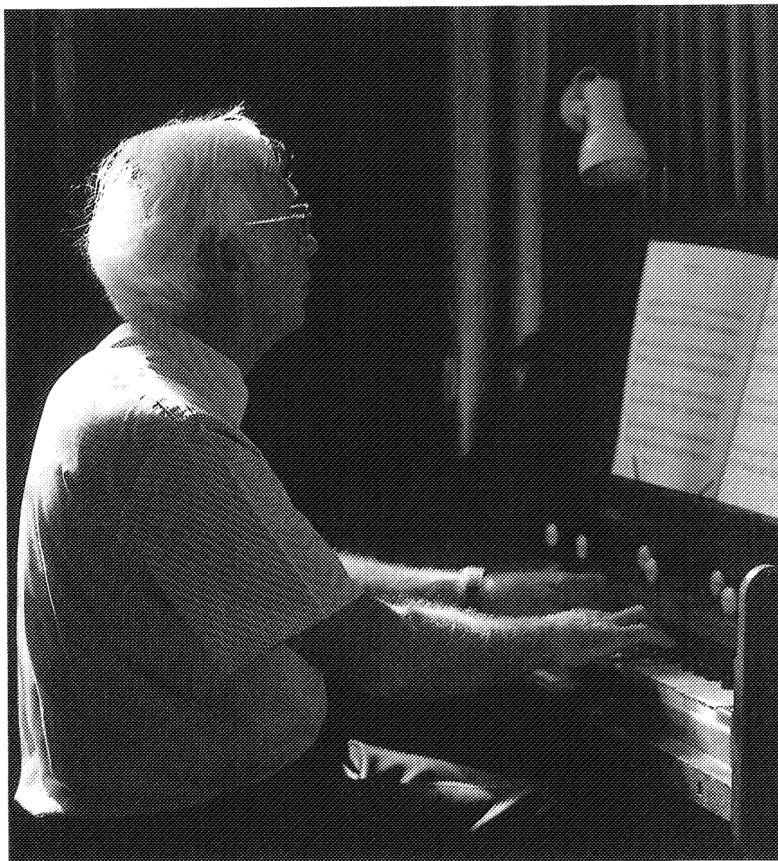
The organist at Riseholme Church, Lincolnshire GG series cover published by G.J. Palmer & Sons Ltd, 16 Blyburgate, Beccles, Suffolk NR34 9TB Printed in Great Britain by Stott Brothers Ltd, Halifax

8.00am Communion 10.30am Morning Prayer 11.45am Annual Church Meeting 6.30pm United Service at St Bedes