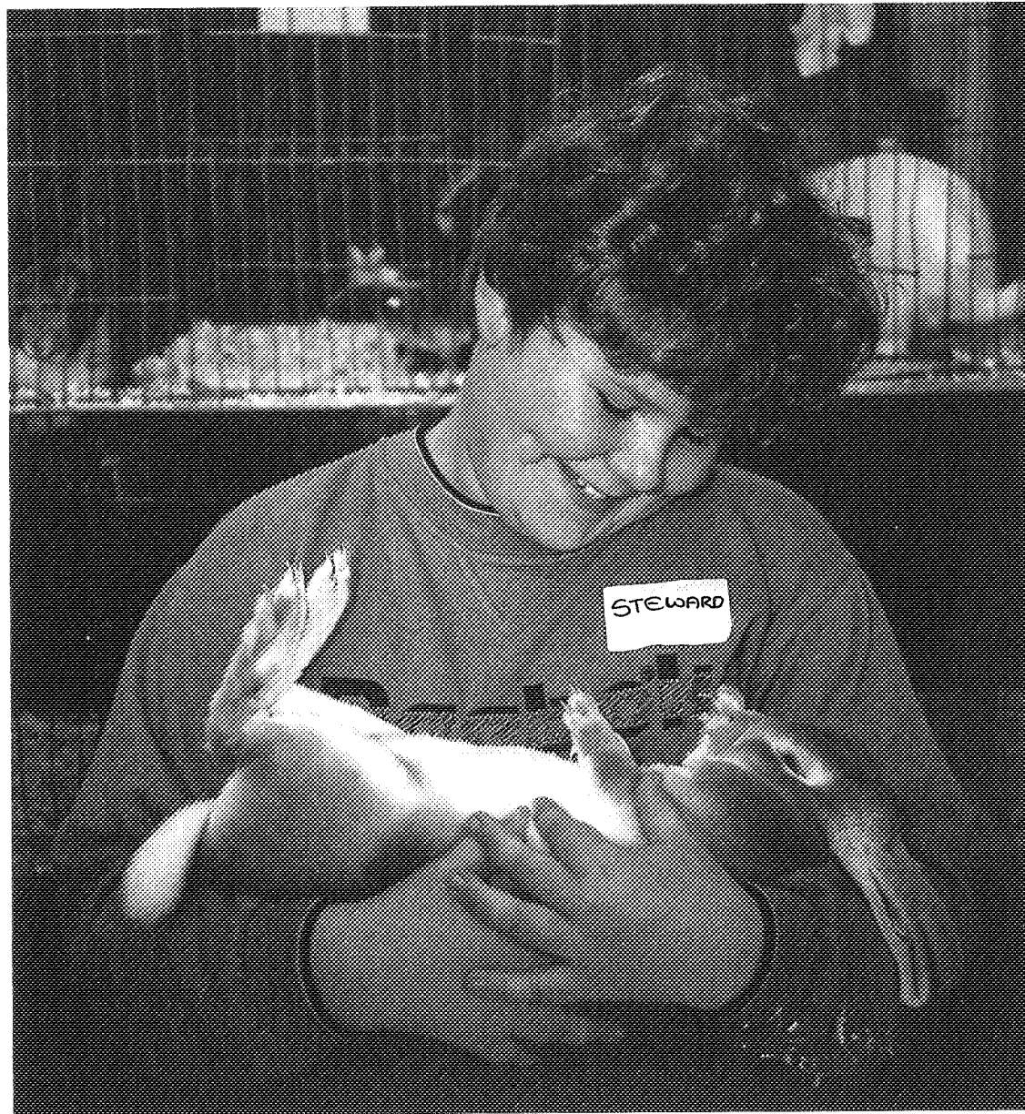
Rabbit show entrant and steward, Marham, Norfolk. GG series cover published by G.J. Palmer & Sons Ltd, 18 Bynardgate, Beccles, Suffolk NR54 9TB Printed in Great Britain by Scott Brothers Ltd, Halifax

8.00am Communion 10.30am Family/Parade Service 6.30pm Evening Communion