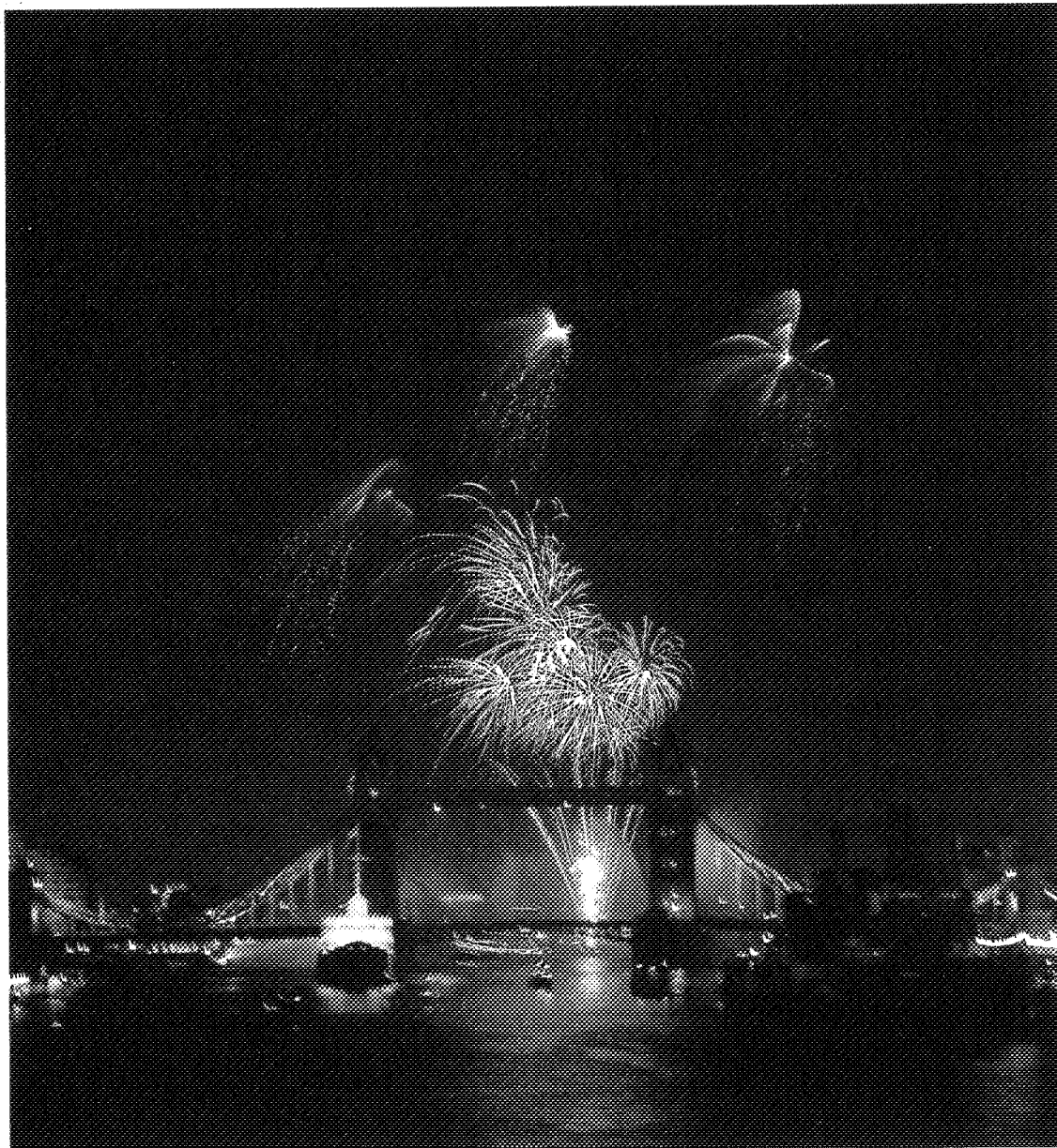
Fireworks over Tower Bridge in the heart of London GG series cover published by G.J. Palmer & Sons Ltd, 16 Blyburgate, Beccles, Suffolk NR34 9TB Printed in Great Britain by Stott Brothers Ltd, Halifax

8.00am Communion 10.30am Morning Prayer & Baptism 6.30pm United Service at Lostock