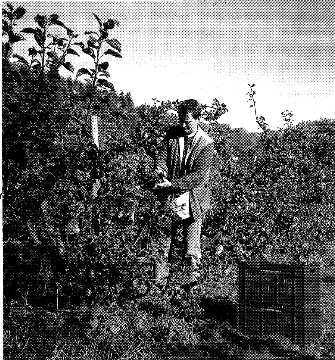
A good crop of apples from this orchard in the North Yorkshire Dales EE series cover published by Chansitor Publications Ltd, 16 Blyburgate, Beccles, Suffolk NR34 9TB Printed in Great Britain by Stott Brothers Ltd, Halifax

8.00am Communion 10.30am Family Communion 6.30pm Evensong