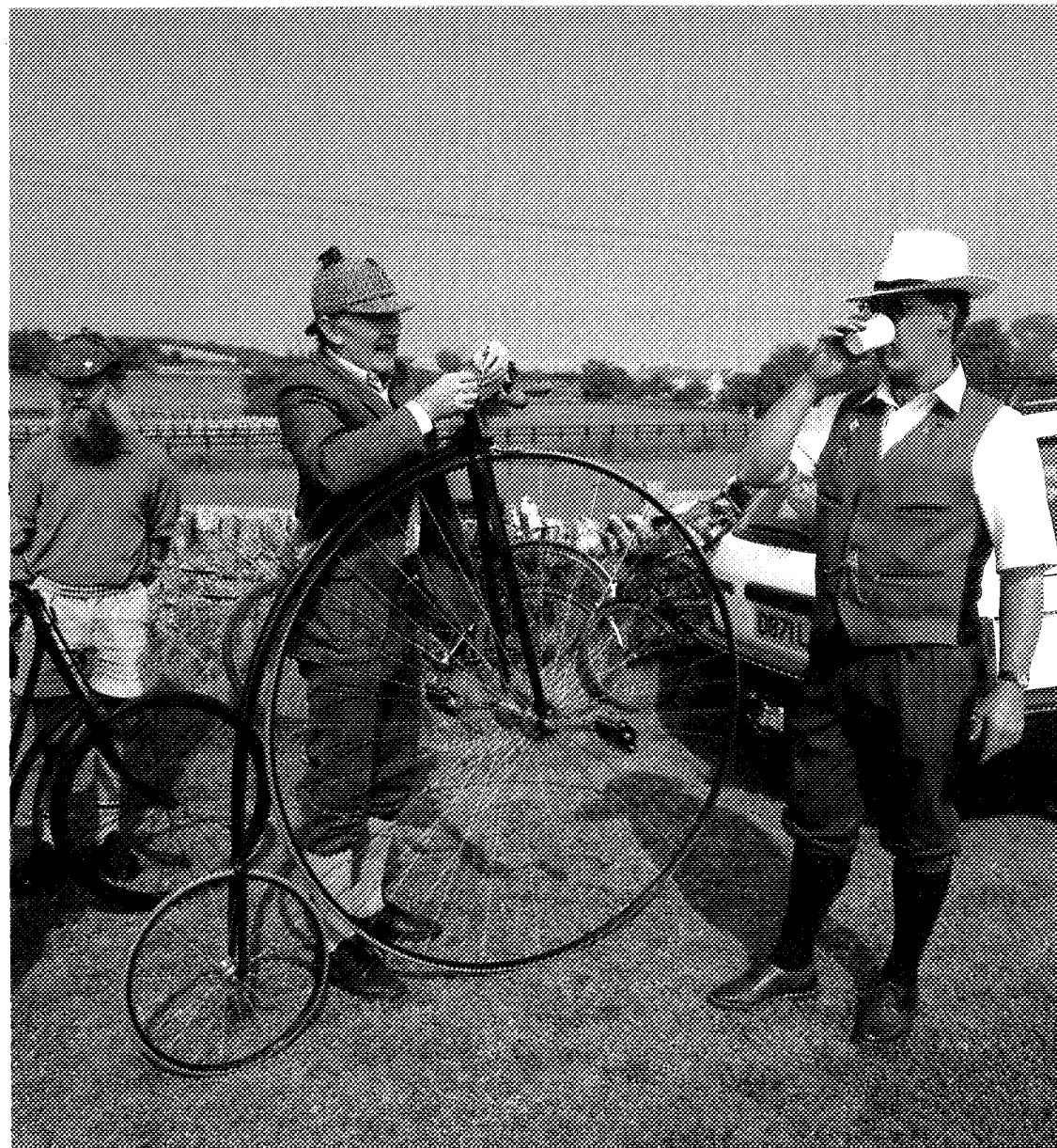
Veterans Cycling Club annual meeting at Northleach, Gloucestershire EE series cover published by Chensitor Publications Ltd, 18 Blyburgate, Beccles, Suffolk NR34 9TB Printed in Great Britain by Stott Brothers Ltd, Halifax

8.00am Communion 10.30am Family Service & Baptism 6.30pm Evening Communion