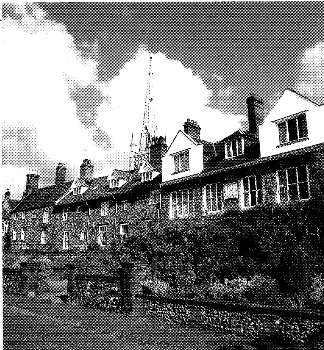
Norwich Cathedral Close retains its tranquil village-like character EE series cover published by Chansitor Publications Ltd, 16 Blyburgate, Beccles, Suffolk NR34 9TB Printed in Great Britain by Stott Brothers Ltd, Halifax