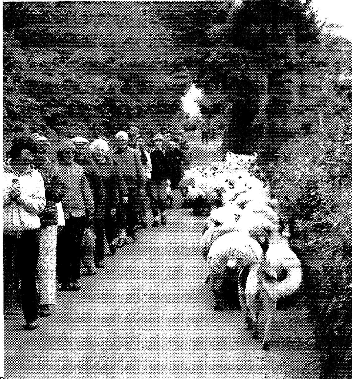
Excellent road sense near Porlock on the coastal fringe of Exmoor EE series cover published by Chansitor Publications Ltd, 18 Blyburgate, Beccles, Suffolk NR34 9TB Printed in Great Britain by Stott Brothers Ltd, Halifax

8.00am Communion 10.30am Family / Parade Service 6.30pm Family Communion