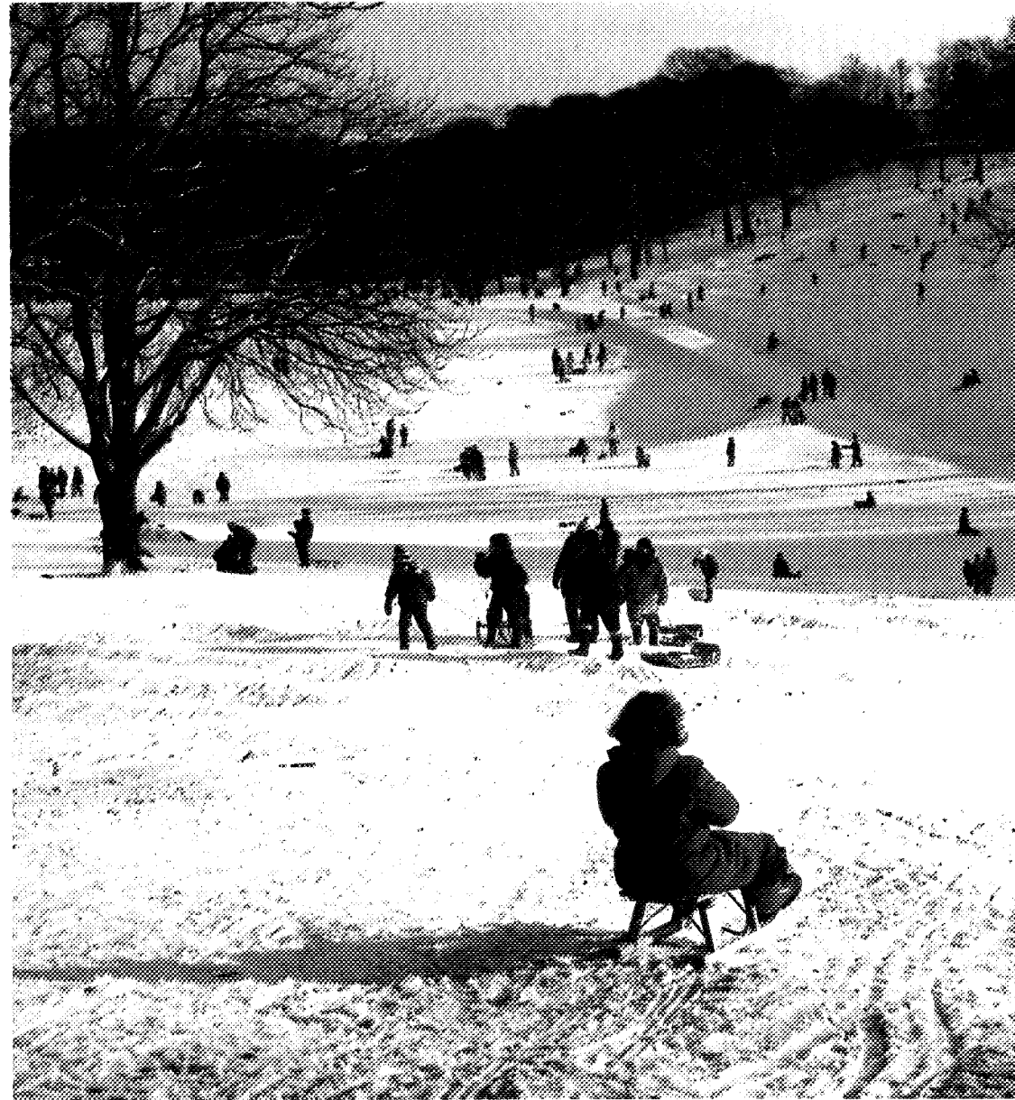
Sledding in Roundhay Park on the north-eastern outskirts of Leeds EE series cover published by Chansitor Publications Ltd, 16 Blyburgate, Beccles, Suffolk NR34 8TB Printed in Great Britain by Stott Brothers Ltd, Halifax

8.00am Communion 10.30am Family/Parade Service 6.30pm Family Communion