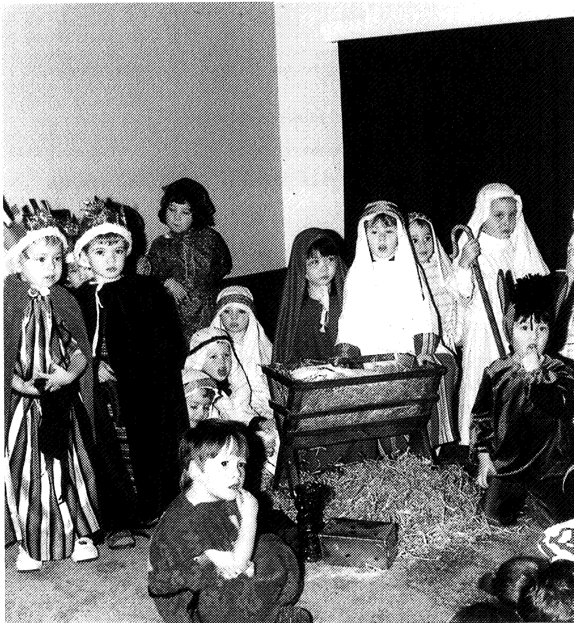
'The playgroup Nativity'

8.00am Communion 10.30am Family Carol Service 6.30pm Christmas Agape