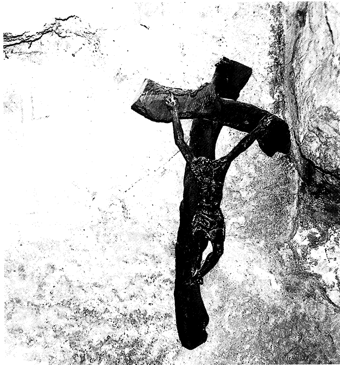
Church of the Martyr, Southampton. ©2 series cover published by Chorley Publications Ltd. 16 Belford, Bexley, Suffolk, NR34 4TB Printed in Great Britain by Swift Brothers Ltd, Holford

8.00am Communion 10.30am Family Communion 6.00pm Evensong