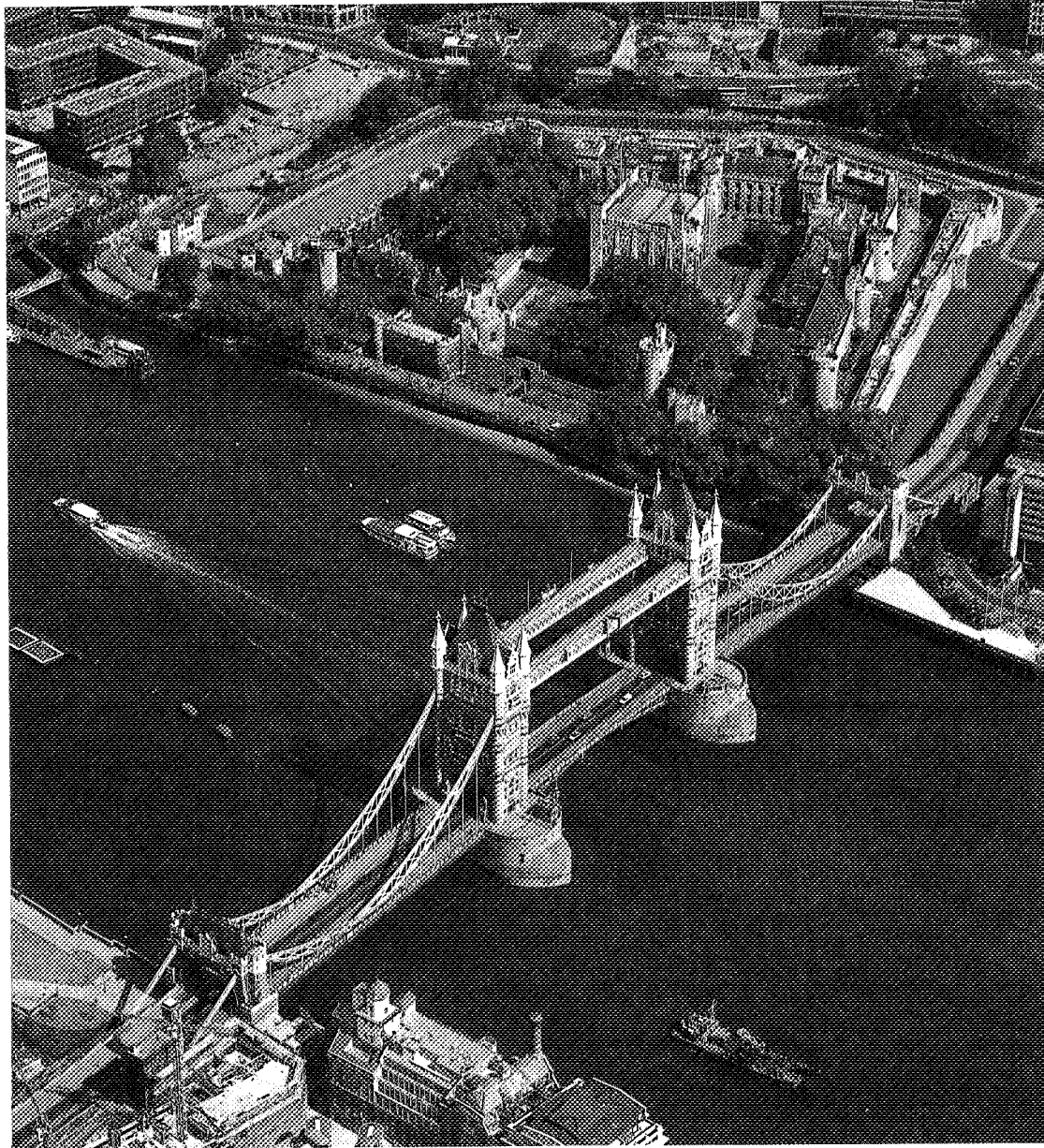
Looking down on Tower Bridge, (BB series cover published by Chansitor Publications Ltd, 16 Blyburgate, Beccles, Suffolk, NR34 9TB; printed in Great Britain by Stott Brothers Ltd, Halifax)