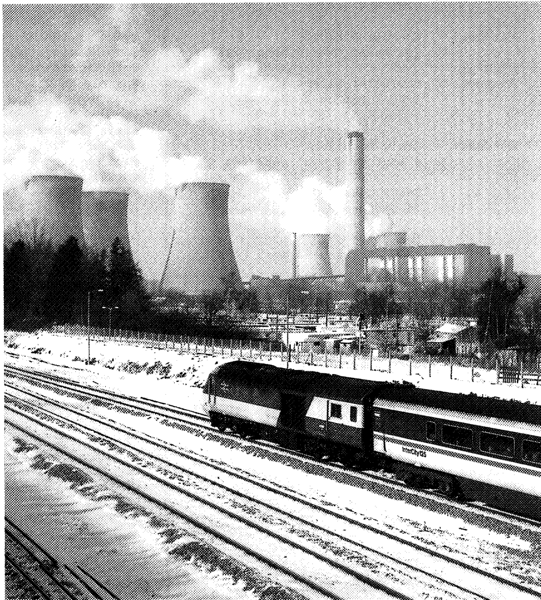
'Transport by power', Didcot, (BB series cover published by Chansitor Publications Ltd, 16 Blyburgate, Beccles, Suffolk, NR34 9TB; printed in Great Britain by Stott Brothers Ltd, Halifax)

8.00am Communion 10.30am Family Communion and Thanksgiving 6.30pm United Service at St Andrews