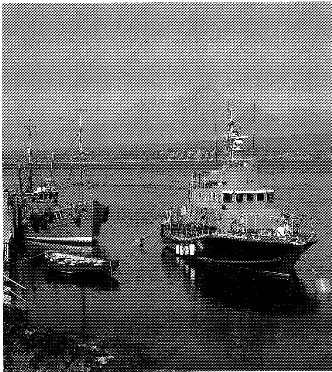
Lifboat at Port Askaig, Isle of Islay, by Bill Meadows (2 series cover published by Chanslor Publications Ltd, 16 Blyburgate, Beccles Suffolk, NR34 9TB, printed in Great Britain by Stott Brothers Ltd, Halifax)