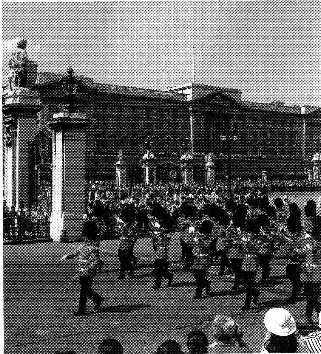
Guards leaving Buckingham Palace, (Z series cover published by Chansitor Publications Ltd, 16 Blyburgate, Beccles, Suffolk, NR34 9TB; printed in Great Britain by Stott Brothers Ltd, Halifax)

8.00am Communion 10.30am Morning Service 6.30pm Family Communion