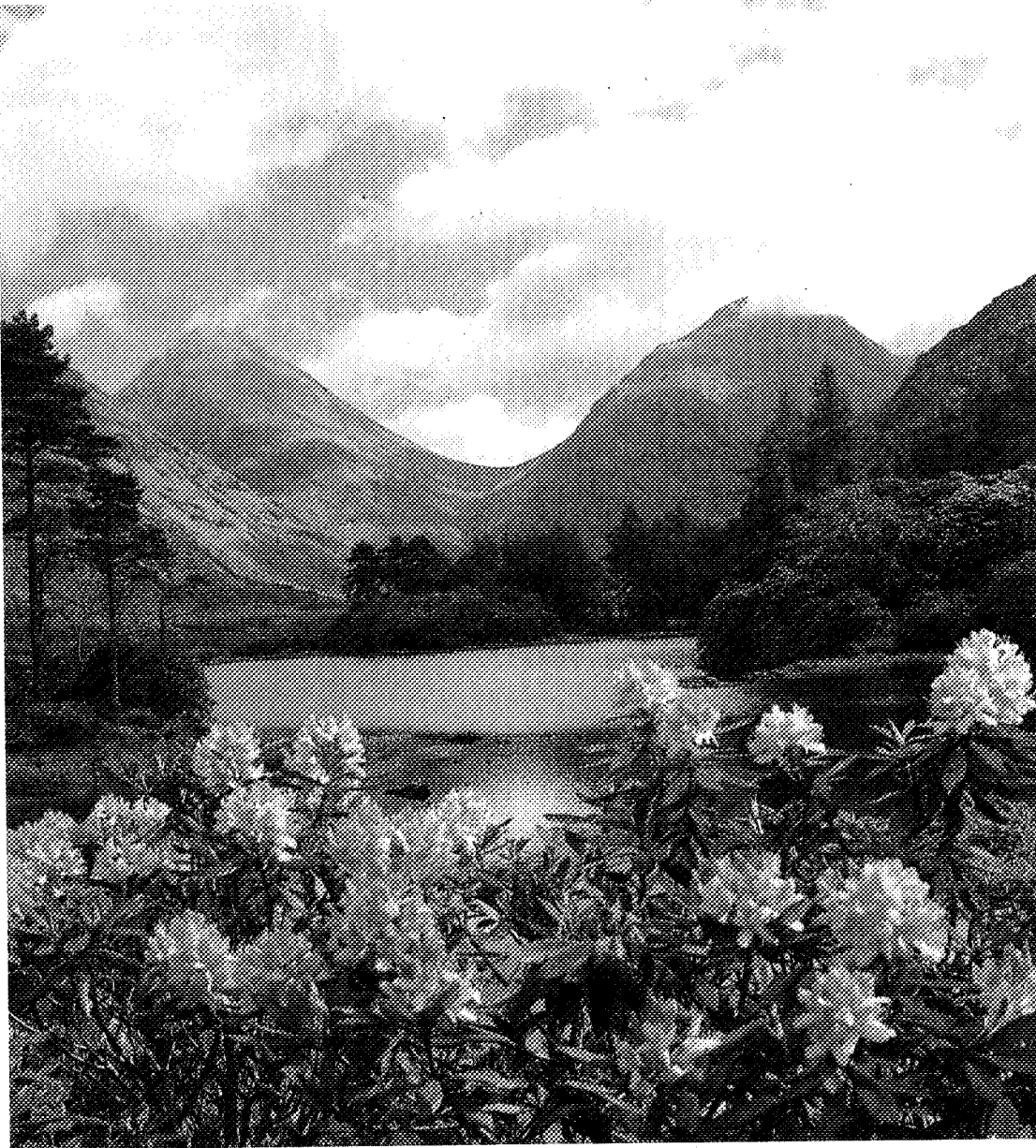
Glen Etive, Strathclyde, (Z series cover published by Chansitor Publications Ltd, 16 Blyburgate, Beccles, Suffolk, NR34 9TB; printed in Great Britain by Stott Brothers Ltd, Halifax)