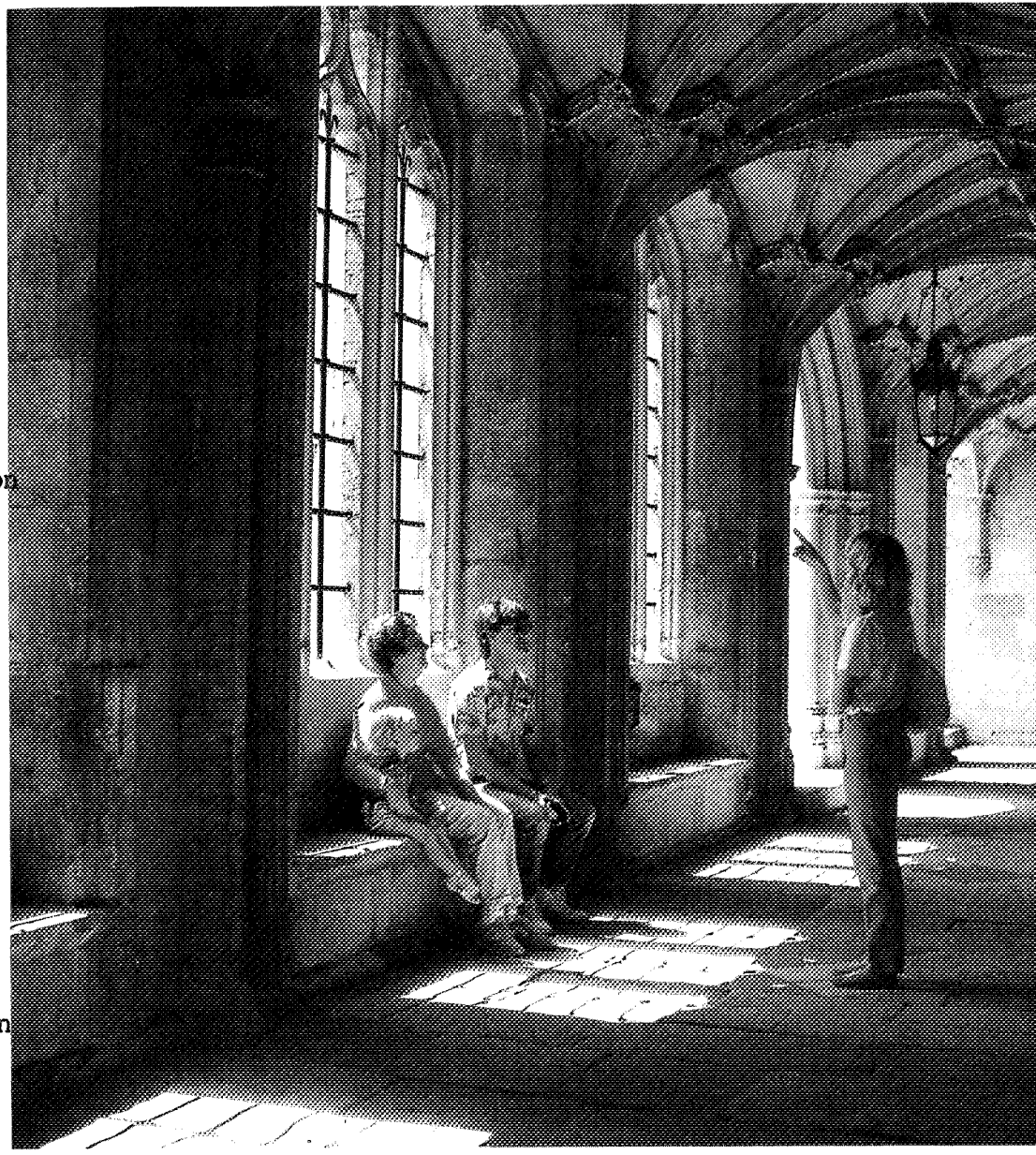
Christ Church Cloisters, Oxford, (Wa series cover published by Chansitor Publications Ltd, St Mary's Works, St Mary's Plain, Norwich, Norfolk, NR3 3BH; printed in Great Britain by Stott Brothers Ltd, Halifax and Oxford)